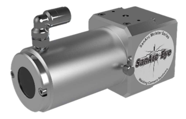
Exterior view of the new SanArc Eye

* SanArc is a trademark of Taiyo Nippon Sanso Corporation