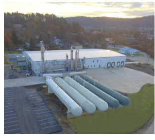
Liquid carbon dioxide business